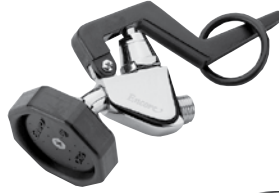
Angled Spray Valve, 3.3 GPM