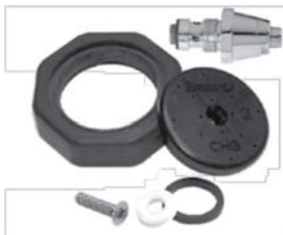
Spray Head Repair Kit