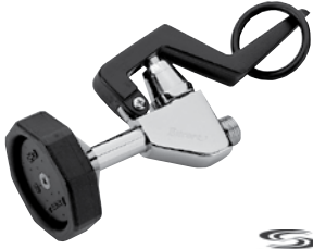
Pre-Rinse Spray Valve, 3.3 GPM