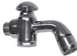
DD Sprayer with Aerator