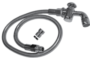
44" (1118mm) DD Hose and Spray