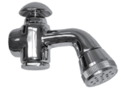
DD Sprayer with Rose Spray