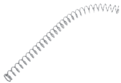
Chrome Plated Spring