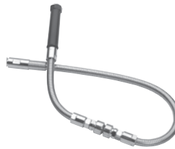
44" (1118mm) Hose w/Continuous Pressure In-Line Vacuum Breaker