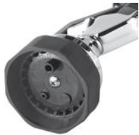
Select-A-Spray™ Valve w/Five Different Settings