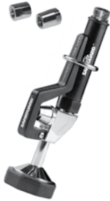
Retro fit spray 1.2 GPM Valve & Grip-Fits Other Manufacturers