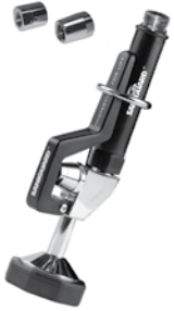
Retro Fit Spray 3.3 GPM Valve & Grip Fits Other Manufacturers