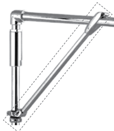
Heavy Duty Swivel Arm Support