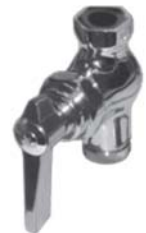
Pot Filler Outlet Control Valve