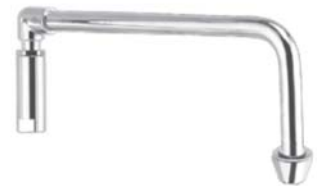
Swivel Arm Assembly