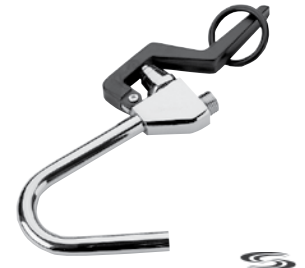
Pot Filler Spray Valve