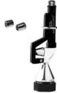
Retro fit Select-A-Spray™ & Grip Fits Other Manufacturers